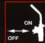
ON - OFF TRIGGER