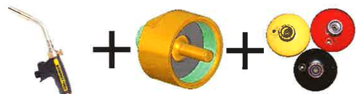
430F Monument Pro Solder & Brazing Torch 437A Adaptor 1" threaded US-style Propane & MAPPro®

437A Adaptor : Adapts MONUMENT 430F torch to 1" CGA600 threaded 1lb steel gas bottles.