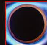
WRAP AROUND TURBINE FLAME