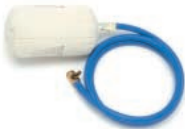
Canvas outer casing with rubber bladder inside Use with pump 1487F see below