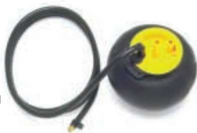
Suitable for blocking off or air testing pipes of 3½ to 6in; 89 to 150mm diameter. Tough rigid plastic central mandrel has inflatable replaceable collar secured by 2 clips. Central nipple is for connection to U Gauge. Reverse end of plug has removable stopper for an air test. Replace stopper and use as a drain plug for blanking off pipes. Equipped with Schrader valve inflation hose. Maximum inflation pressure 12psi 0.86 bar. Ideal for use with 174Z Air testing kit. Use with pump 1308Q see below