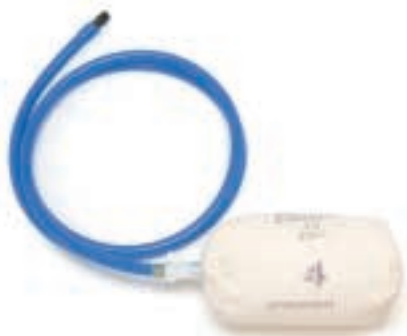
Canvas outer casing with rubber bladder inside, Schrader valve Use with pump 1308Q see below