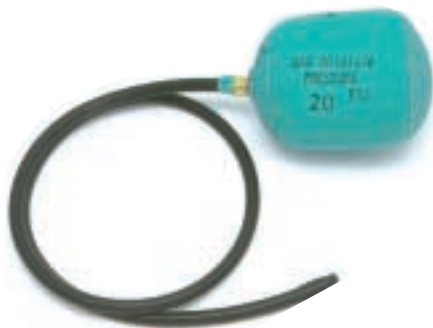
Nylon outer casing; fitted with Schrader valve Use with pump 1308Q see below